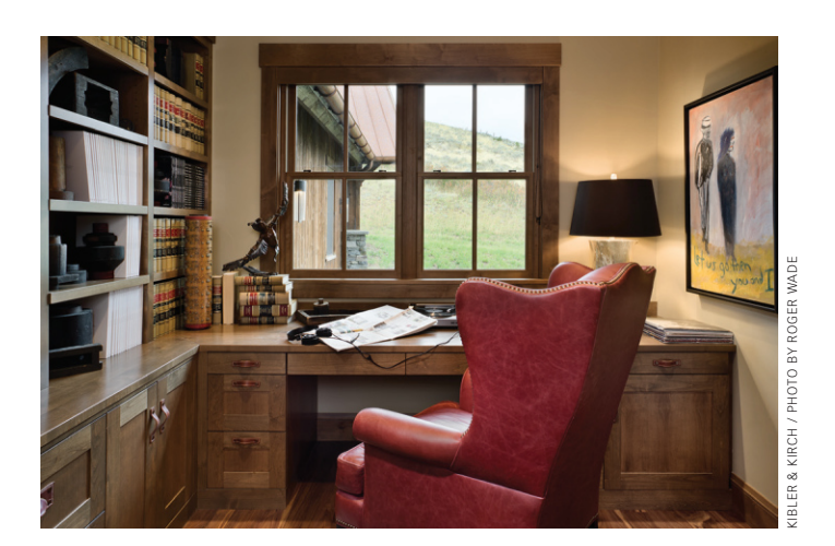
A cozy and comfortable workspace can relieve some of the stress brought on by the day.

While some people just require a desk and a laptop, others need storage or prefer a standing desk. "Being organized is huge," Hoffmann says. "Start each day by giving yourself a clean palette. When we used to commute, we had that buffer, but now you have one minute to get into work mode. I would advise creating a ritual. I'll take a few minutes to clean up my desk. ... It's a moment of preparation to set yourself up for a more productive work experience." She also